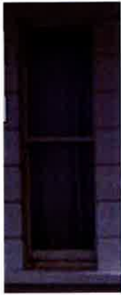
6. Timber framed sliding sash window