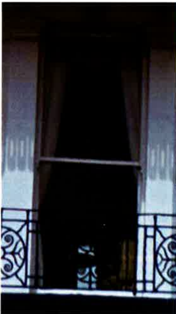
5. Timber framed sliding sash window