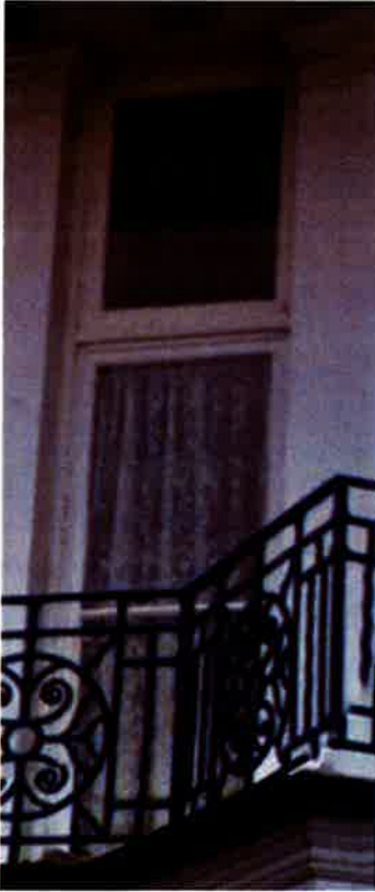
4. Timber framed sash window