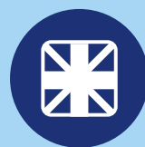
UK Manufacturer and Supply Chain