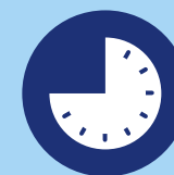
Scale of Delivery