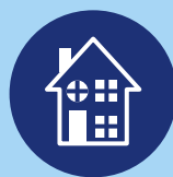
Private Housing Adoption