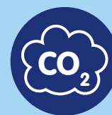
Whole Life Carbon