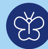
Natural Resource Depletion