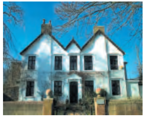
The Old Rectory