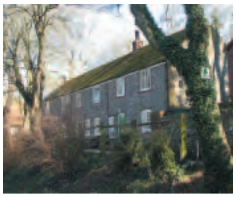
Bank Cottages Youth Hostel

The graveyard around the Parish Church of St Laurence is an open area of informal space which slopes down towards the road. There are several mature trees in the churchyard and a flint wall runs through the yard. This would have marked the original extent of the graveyard, however it now extends into a parcel of farm land which is demarcated by a post and rail fence.