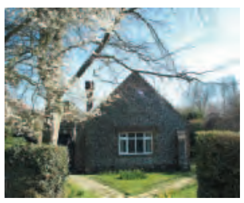
Telscombe Village Club