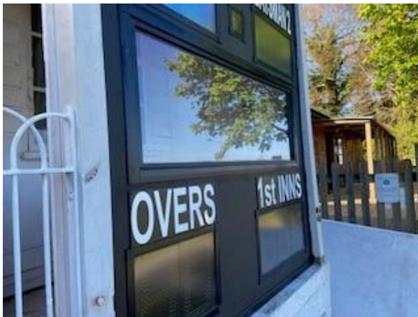
Ringmer Cricket Club