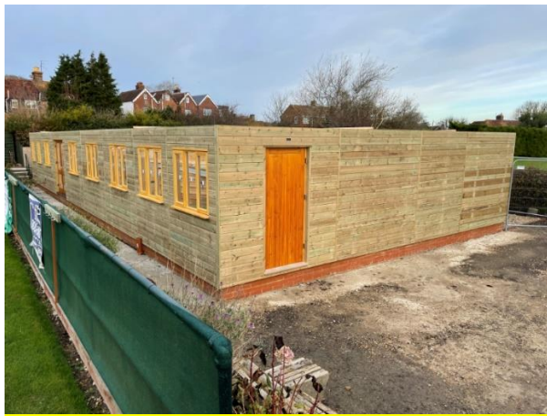
Ringmer Bowls Club