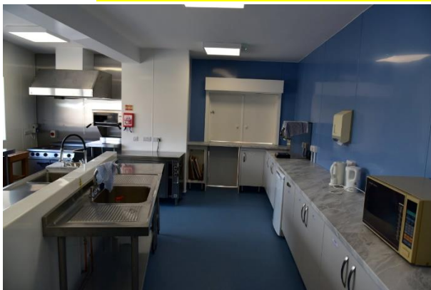
Ringmer Village Hall Jack Hart Kitchen