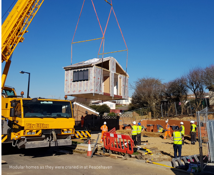
Modular homes as they were craned in at Peacehaven

The latest step in Lewes District Council's pioneering development of new modular properties in the district will see 13 affordable homes built in Newhaven.