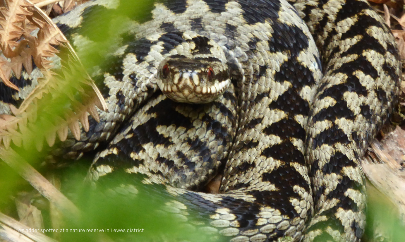
An adder spotted at a nature reserve in Lewes district