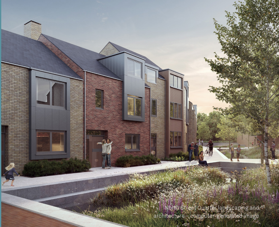
North Street Quarter landscaping and architecture – computer-generated image

The proposed North Street Quarter development in Lewes has reached a significant milestone with the approval of detailed plans for the landscape and appearance of phases two and three by the South Downs National Park Authority (SDNPA).