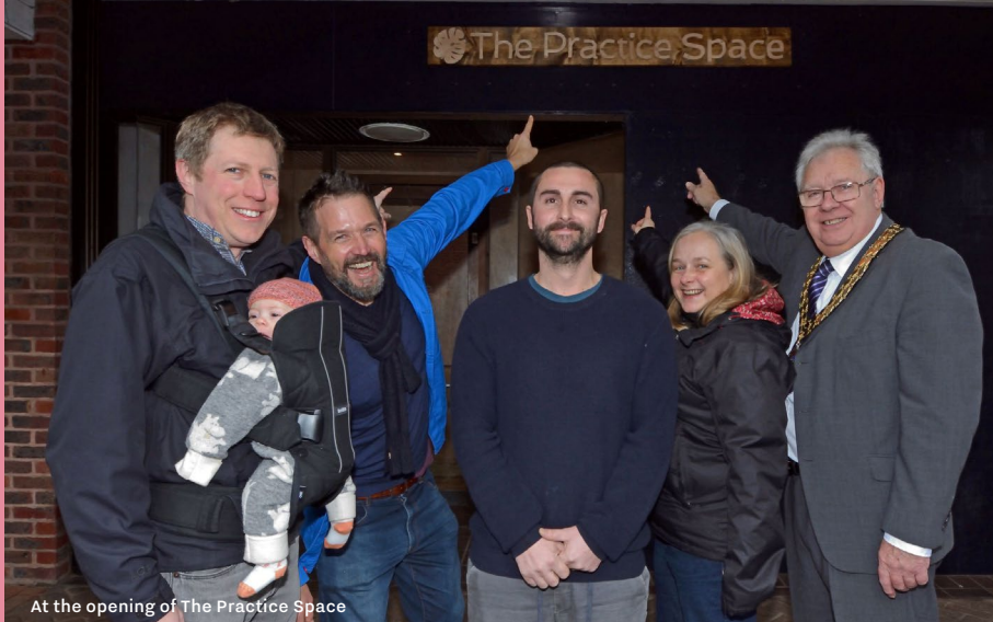
At the opening of The Practice Space

“Life on the high street for retailers is exceptionally tough and that’s no different wherever you live and work. However, there is no doubt that in Newhaven a new generation of independent enterprises can thrive in the town.