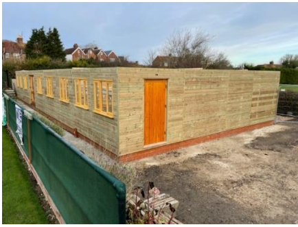
Ringmer Bowls Club