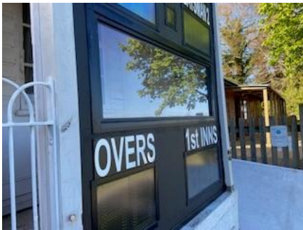
Ringmer Cricket Club