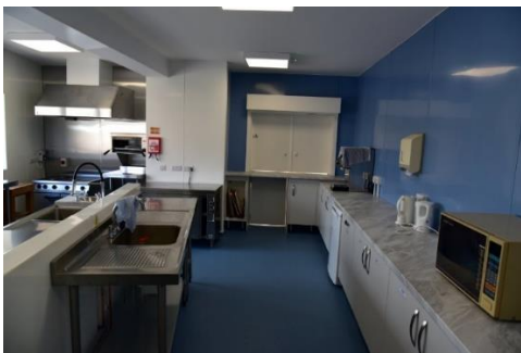
Ringmer Village Hall Jack Hart Kitchen