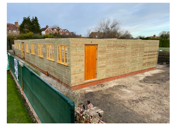
Ringmer Bowls Club

CIL is intended to focus on the provision of new infrastructure and should not be used to remedy pre-existing deficiencies in infrastructure provision unless those deficiencies will be made more severe by new development. It can, however, be used to increase the capacity of existing infrastructure or repair failing existing infrastructure, if it can be demonstrated that these works are necessary to support new development.